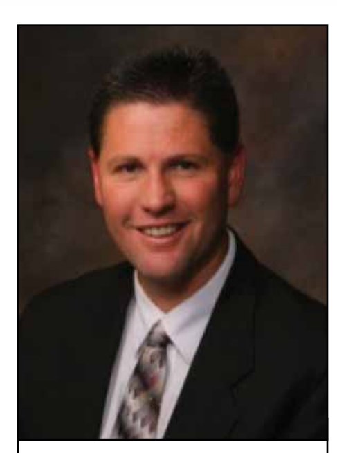
ROBERT C. CUFF, CAA UHSAA EXECUTIVE DIRECTOR

We must rededicate ourselves to the values and traditional purposes of education-based activities as part of the total educational framework. We must expect high levels of sportsmanship by enforcing standards of excellence within all of our activities at all times. We must answer the call to use TEAM (Teach, Enforce, Award, Model) to